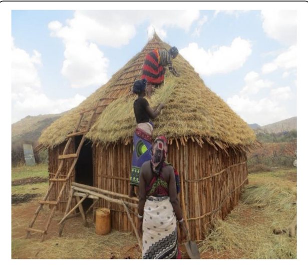
Figure 3 Women making hut in marro. This figure is a picture taken in Harowayu pastoralist association while women in marro are constructing a hut or house for their marro woman. A woman and her marro cut trees and covering grasses and bring these to the location where she and her marro are making the hut together, with no involvement of husbands

resource. They stated that Borana women bear a disproportionate burden of household domestic roles including cooking, fetching water, collecting firewood, cleaning, hut-making, going to market and taking care of children and the sick. Moreover, increases in droughts have added to the work burden of the already busy women by extending the time needed to collect firewood and fetch water. In order to overcome the common labour shortage, even under normal circumstances, many women combine some