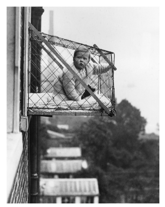
Figure 1. An example of the wire cage fixed to the tenement window, so that babies can benefit from sunshine and fresh air. London, 1934.

fortification of dairy products with vitamin D in Europe (Holick, 2006b). Interestingly, it seems now that the outburst of hypercalcemia may not be attributed to an excessive supplementation, but also could be explained by coexistence of relatively rear diseases, including: Williams' syndrome (Wacker & Holick, 2013), primary hyperparathyroidism (Michels & Kelly, 2013) or even sarcoidosis (Nunes et al., 2007). It could be also caused by specific mutation of CYP24A1 coding the main catabolic enzyme for vitamin D (Jacobs, 2014), resulting in abnormally high level of vitamin D in serum.