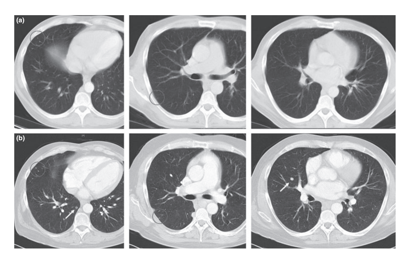
Figure 2 Patient no. 3 showed in the contrast-enhanced CT 42 days prior to DDLT (a–lung window, high resolution kernel, 8-mm slice thickness) two very small lesions in the right middle and lower lobe, each with 2-mm diameter and nonsolid density. The control CT 6 months post-LT (b-lung window, high resolution kernel, 5-mm slice thickness) showed multiple new intrapulmonary metastases in both lungs, but the initially found two lesions unchanged.

distant metastases [26]. Well-differentiated and low tumor grades had lower activity on PET and correspondingly lower PET scores. The same holds true for using FDG-PET for the detection of extrahepatic or pulmonary metastases of HCC. The detection rate of FDG-PET was found to be 83% for extrahepatic metastases larger than 1 cm in greatest diameter and only 13% for lesions less than or equal to 1 cm [27,28]. This discrepancy can easily be explained with the technical base of PET scans. The currently available detectors have a spatial resolution of minimum 5 mm. In addition, the PET scan per bed position (i.e. width of detector ring, currently 15 cm) needs 1-4 min, depending on scanner generation. On account of this much time taken, the patients will be examined with constant shallow breathing, which leads to movement of small lesions and further reduction of the spatial resolution. In our institution, there is experience in using FDG-PET since the late 1990s and in combined imaging with PET/CT since 2001. As all of our patients had multiple lung nodules smaller than 1 cm, we did not include a PET or PET/CT scan to further evaluate these patients.