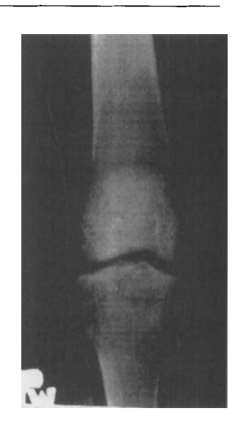
Fig. 1 X-ray of the right knee: a characteristic finding of patchy osteoporosis