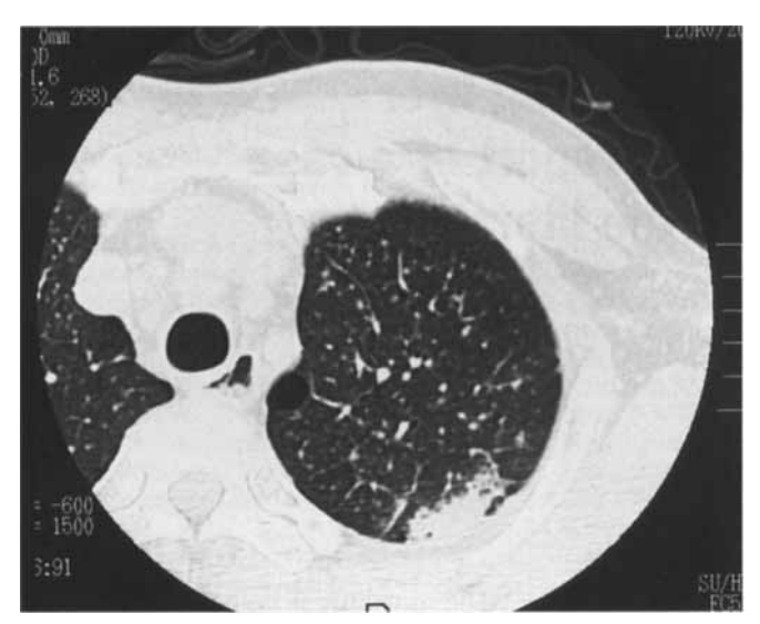
Fig. 1 Computed tomogram of the chest demonstrating miliary lesions in both lungs and an infiltrate in the left upper lobe of the lung

cific DNA fragments of Mycobacterium tuberculosis (Amplicor, Roche Molecular Systems, Branchburg, N.J., USA) in bronchial alveolar lavage (BAL) fluid. The acid-fast bacilli (AFB) stain of BAL was negative. At this point, the patient's FK 506 whole blood trough level was 23 ng/ml. Because an infectious complication was suspected, his FK 506 dose was decreased from 8 mg to 4 mg/day and prednisolone from 10 mg to 5 mg/day. He was started on isoniazid (INH), 400 mg/day, ethambutol (EB), 750 mg/day, streptomycin (SM), 1 g i.m./day, and rifampicin (RFP), 450 mg/day (Fig. 2).