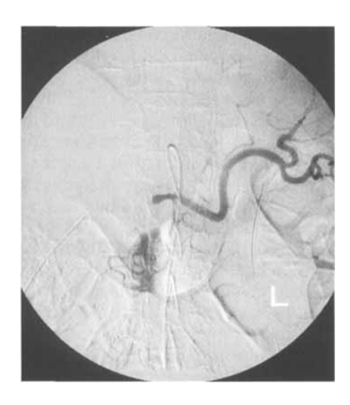
Fig.2 Hepatic artery thrombosed