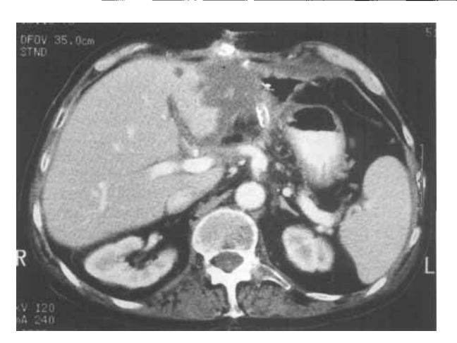
Fig.4 CT scan showing necrotic areas within the left lateral segments of the liver

consisted of cyclosporin (CyA), steroids, and azathioprine. The postoperative course was completely uneventful and the patient was discharged on postoperative day 25 with normal liver function tests but slightly elevated creatinine values.